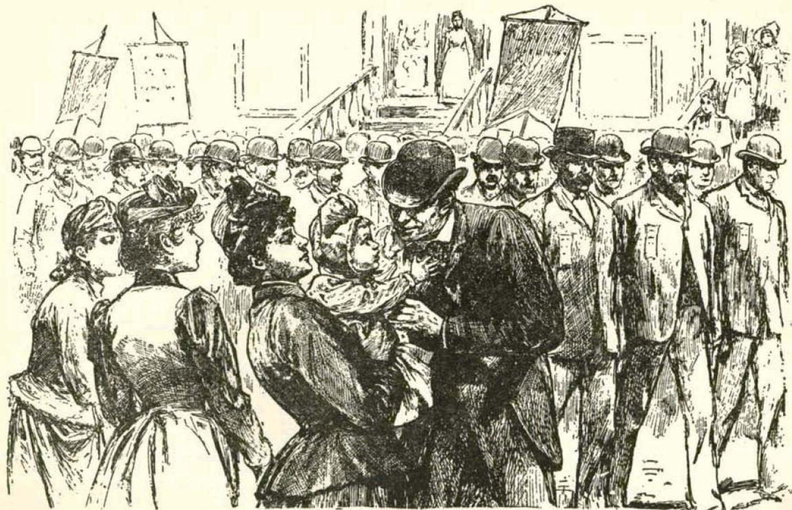
CHICAGO WORKERS PARADE ON THE FIRST INTERNATIONAL MAY DAY, 1890