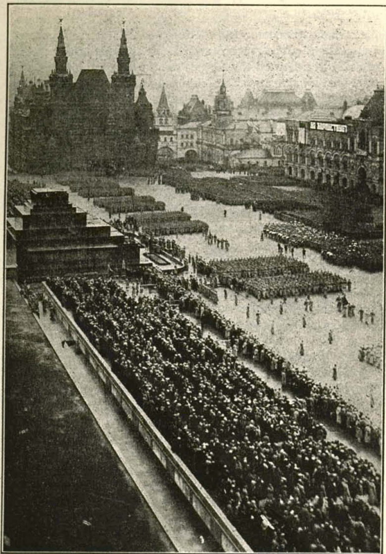
THE RED ARMY AND MOSCOW WORKERS CELEBRATE MAY DAY ON RED SQUARE WITH MEMBERS OF THE GOVERNMENT AND DELEGATES FROM WORKERS' ORGANIZATIONS OF MANY LANDS REVIEWING THE PARADE